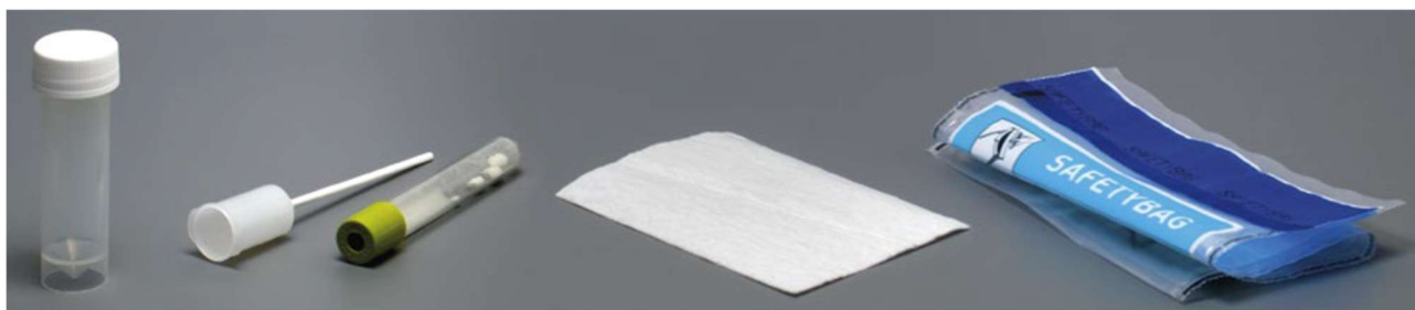
urine collection container tube and straw